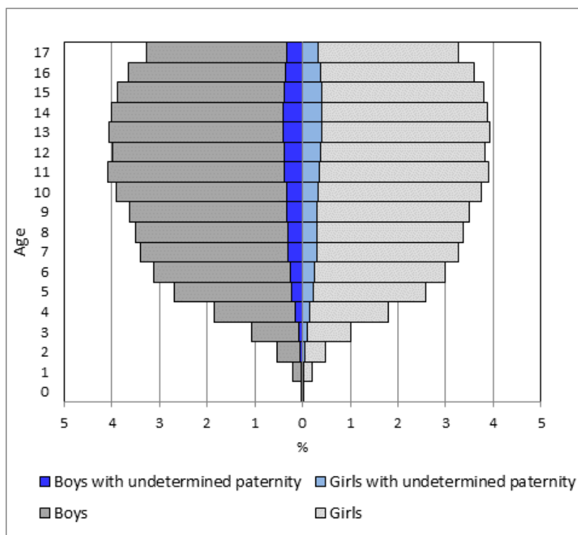
Graph 2 Age pyramid of children aged 0-17 in the educational system, highlighting those of undetermined paternity